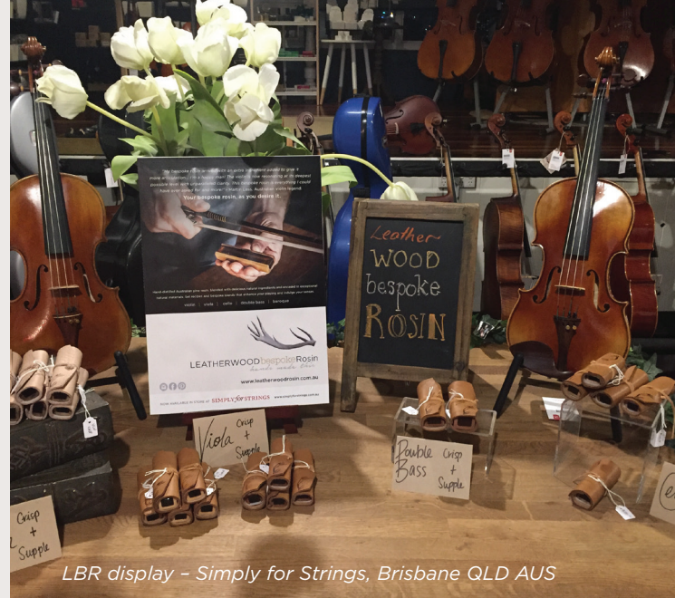
LBR display - Simply for Strings, Brisbane QLD AUS

Samples of all recipes are provided to stores free of charge and can be used to allow clients to find their ideal sound. To swap rosins clients can give their bow hair a thorough wipe down with a dry cotton cloth to remove most of the residual rosin. Once they apply LBR (only 2-3 swipes should be enough) they will feel the difference immediately.